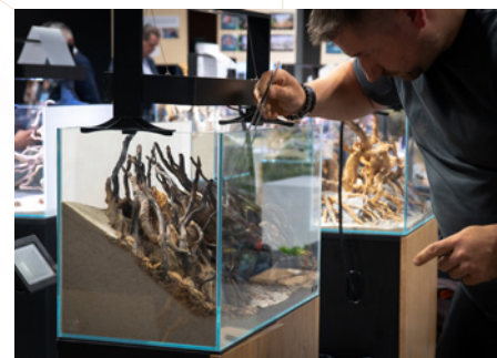
AQUAEL Hardscape Challenge competition during Animals' Days 2021 in Nadarzyn