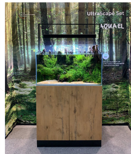
Zoomark exhibition 2021 in Bologna