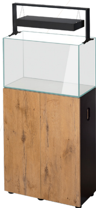
UltraScape 60 Set forest UltraScape 60 Cabinet forest