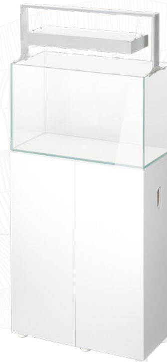
UltraScape 60 Set snow UltraScape 60 Cabinet snow

The ideal tank proportions – the depth of the UltraScape 90 Set and the optimum height of the UltraScape 60 Set , recognised by aquascapers – allow for the creation of unlimited arrangements, following both the experimental and classic trends. Transparent silicone, polished, sanded edges and precise, butt-bonded glass are important finishing features in the premium range of tanks.