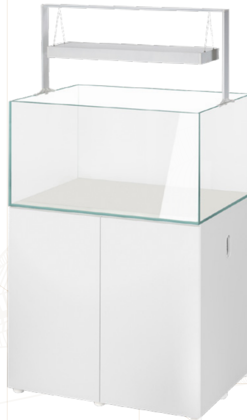
UltraScape 90 Set snow UltraScape 90 Cabinet snow