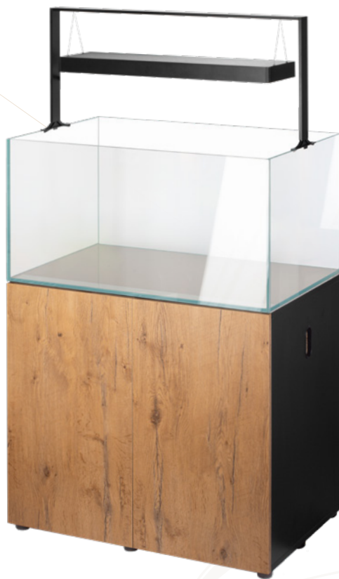
UltraScape 90 Set forest UltraScape 90 Cabinet forest