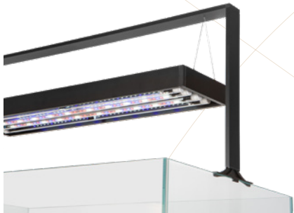
energy-efficient Leddy Tube lighting included